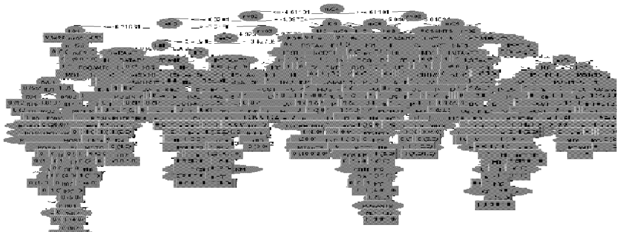
Fig. 2. Decision Tree (c)

In this paper, in case of the data that are large-scale and very low illegal use rate for constructing, we don't have a concrete