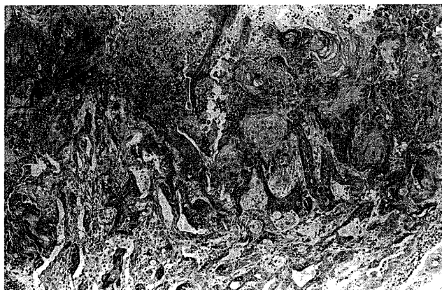
Fig. 1. Squamous cell carcinoma, \times 100 HE staining

before use. This solution was given to rats ad libitum for 10 weeks from light-opaque bottles exchanged at 2 or 3 day intervals 20,21 .