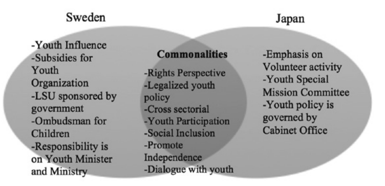
Figure 2: Differences and Commonalities of Swedish and Japanese modern youth policy

Another analysis that he gave was on modern legislated youth policy based on the above comparison of the historical development of youth policy in Sweden and Japan. With the self-organized framework, he sorted youth policy established during 1993 to 2015 Sweden and Japan in and their main efforts for youth participation, which is summarized in Table 3. Each countries' national youth policy partly includes some of the essence in its own context and is implemented on different levels according to the situation of young people. Some of the elements are shared between the two countries and some are not. Based on Table 3, characteristics and commonalities between the two countries' youth policy from 1993 to 2015 are described in Figure 2.