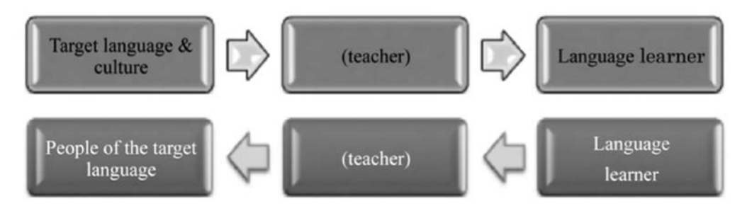
FIGURE 1. Creative and Contributive Goals of Language Learning (Okamoto, 2016, p. 378)

Taking into consideration the minor status of Hungarian in Japan, it is not a common choice of students when it comes to foreign language learning. Thus, Okamoto (2016) formulated the question: How do we motivate students in the HFL classroom? As an answer, Okamoto (2016) proposed the 3C's theory, in which the three C's stand for communicative, contributive and creative motivational goals. Communicative refers to the use of Hungarian for communicative purposes. Contributive means that not only do Japanese students benefit from the interaction by receiving knowledge but also by providing knowledge to Hungarians, they contribute to the target language speakers' community. Further, creative stands for the process of not only receiving but creating Hungarian content while engaging in the activity.