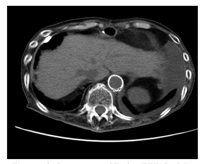
Figure 1-b. Postoperative CT after TEVAR of the sealed ruptured aneurysm of the descending aorta (Case 3)

Postoperative CT demonstrated stent-graft seal of the rupture site.