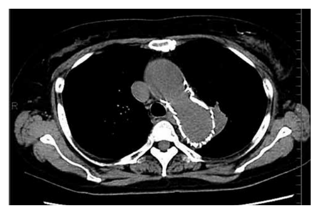
Figure 2-b. Postoperative CT after TEVAR of the rapidly growing aortic aneurysm (Case 1) Postoperative CT demonstrated that the stent-graft completely covered the aneurysm.

Preoperative CT demonstrated a rapidly growing aortic aneurysm.