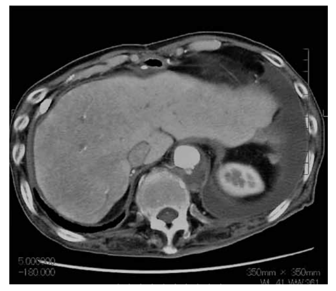
Figure 1-a. Preoperative CT of ruptured aneurysm of the descending aorta (Case 3) Preoperative CT demonstrated penetration of the descending aortic aneurysm with sealed rupture and

showed Streptococcus infection, with a WBC count of 11,010/µl and CRP level of 7.1 mg/dl preoperatively. After 7 days of antibiotic therapy, the blood culture showed no Streptococcus bacteria and the blood examination revealed that WBC count and CRP level decreased to 6410/\mu l and 2.0 mg/dl, respectively (Table 1). Another early case showed MSSA infection. The WBC count of these patients was 13,700/\mu l, which decreased to 8,686/\mu l postantimicrobial therapy (Table 2). Because the CRP level decrease was significant (CRP reduced from 16.4 mg/dl to 3.0 mg/dl), we performed early TE-VAR to prevent aneurysm rupture. Elective cases showed a significant decrease of WBC count and CRP level after antimicrobial therapy (mean, 11,683 to 6,047/µl in WBC count, 10.3 to 1.6 mg/dl in CRP level). After TEVAR, we continued antibi-