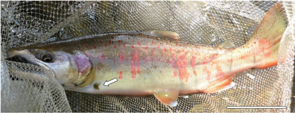
Fig. 1. Anadromous adult male of Oncorhynchus masou ishikawae (327 mm SL) infected with an adult female of Argulus coregoni (arrow, 13.0 mm long) on the body surface near the gill operculum. The fish was collected in the Usa River, a tributary of the Nishiki River, Yamaguchi Prefecture, on 3 October 2014. Scale bar: 75 mm.