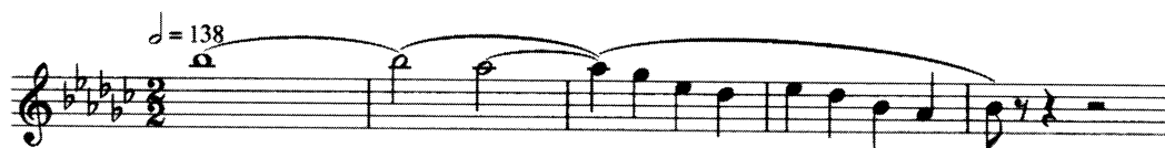
EXAMPLE 2. Theme B (Allegro, mm. 13-17)