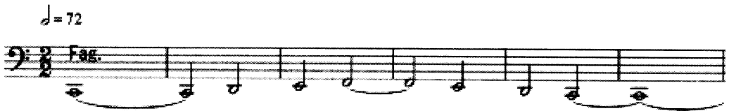
EXAMPLE 6. Theme A in a parallel key (Finale, mm. 5-10)

Thus, we can see that thematic transformation employed along with the programmatic technique do indeed play very important roles in structuring the composition. What is most interesting here is that the thematic transformation could show us the 'diachronicity' or narrative of Hiroshima as a peaceful city destroyed and then recovered from the deadly devastation of the atomic bombing. This aspect should be examined much more deeply. Theme A as the main theme of this symphony could also play a leading role of telling this narrative so we could call it the "Hiroshima motif". It is first designated in the Introduzione. This "gloomy" theme is a harbinger of the historical tragedy about to befall the city. Theme B of the Allegro depicts a peaceful state of the Japanese city, but soon after that the Hiroshima motif reappears in an augmented form representing a bad omen. In the Culinazione, the catastrophe occurs as Aaltonen explained. We have already seen how the themes are used in this climactic part. To reiterate, following the military march, the Hiroshima motif reappears in C-major modulating into c-minor suddenly as if to imply the start of the tragic event. All of the themes reappear mingling together and then are dispelled by the sound of the explosion that calls to mind the destruction of everything. After the theme-less Epitafio shows nothing is left, the Hiroshima motif returns in a major key implying that the residents of Hiroshima would eventually overcome the disaster.