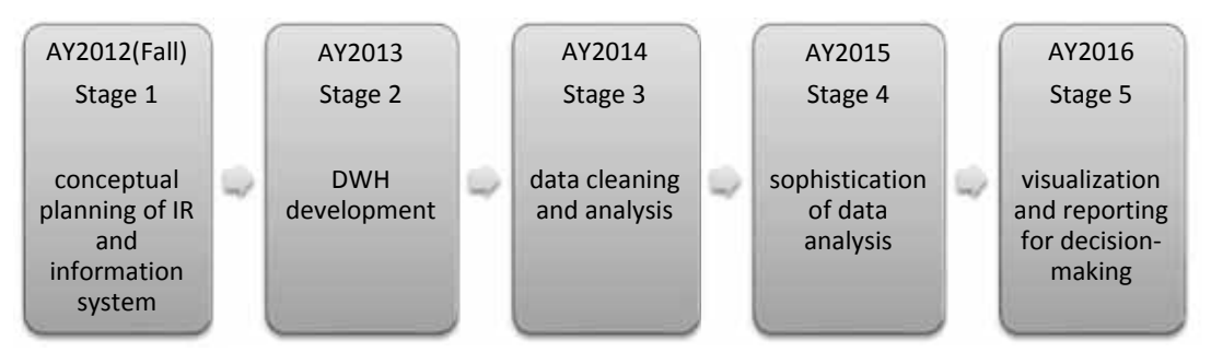
Figure 3. Development process of IR and DWH at APU