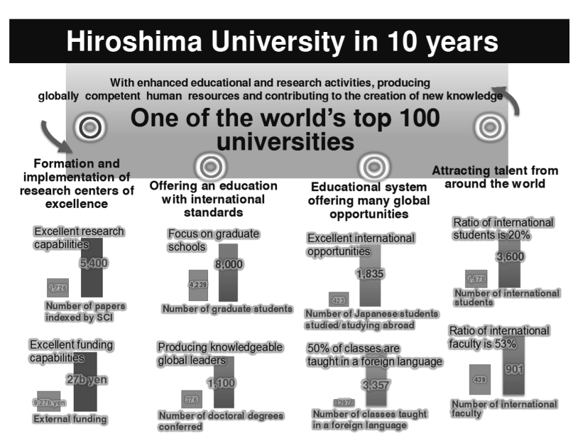
FIGURE 1. Sample of SGU Benchmarks at Hiroshima University (Asahara & Sakakoshi, 2014, p.2)

Benchmarks to be reached by 2024 are at the heart of these plans. Many of the benchmarks set by universities appear to indicate the growing importance of English as the language of academia in Japan. (See Figure 1 for an example.)