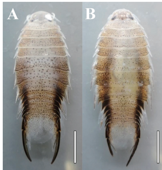
Fig. 2. Two ovigerous females of Nerocila phaiopleura , NSMT-Cr 24611, from Scomberomorus niphonius in the Seto Inland Sea. Dorsal view. A, female, 20.5 mm long, with normal uropods; B, female, 21.1 mm long, with a shorter exopod of the left uropod. Scale bars: 5 mm in A and B.