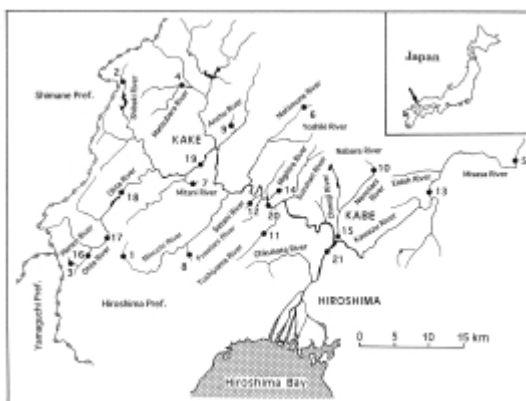
Fig. 1. Map of the Ohta River Basin, showing the locations of 21 sampling sites.

Altitude, distance from riverhead, riverbed slope and valley area were calculated on the basis of maps (1/50,000). River width was measured with a tape measure at the rapid. Electric conductivity was measured with a salinometer (YSI, Model 33, Yellow Springs Instrument Co. Inc., OH, USA) as an indicator of water quality. The lowest temperature in February and the highest temperature in