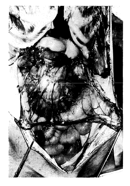
Fig. 3. Abdominal cavity

moderate acute congestion. 5) Spleen. Extreme atrophy and moderate acute congestion. 6) Adrenal gland. Moderate atrophy and mild acute congestion. 7) Liver. Moderate atrophy, acute congestion, and moderate deposition of lipofuscin granules and moderate fatty metamorphosis in the hepatocytes. 8) Pancreas. Moderate atrophy, mild edema, and moderate autolysis. 9) Ovary: Extreme atrophy.