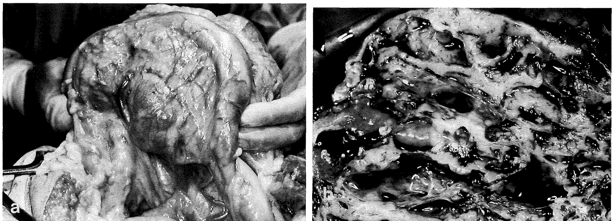
Fig. 2-a. On laparotomy, the tumor was located at the anterior sheath of the transverse mesocolon.

Fig. 1-c. Supramesenteric arteriography showed an irregular tumor stain and revealed that the feeding artery was the midcolic artery (arrow).