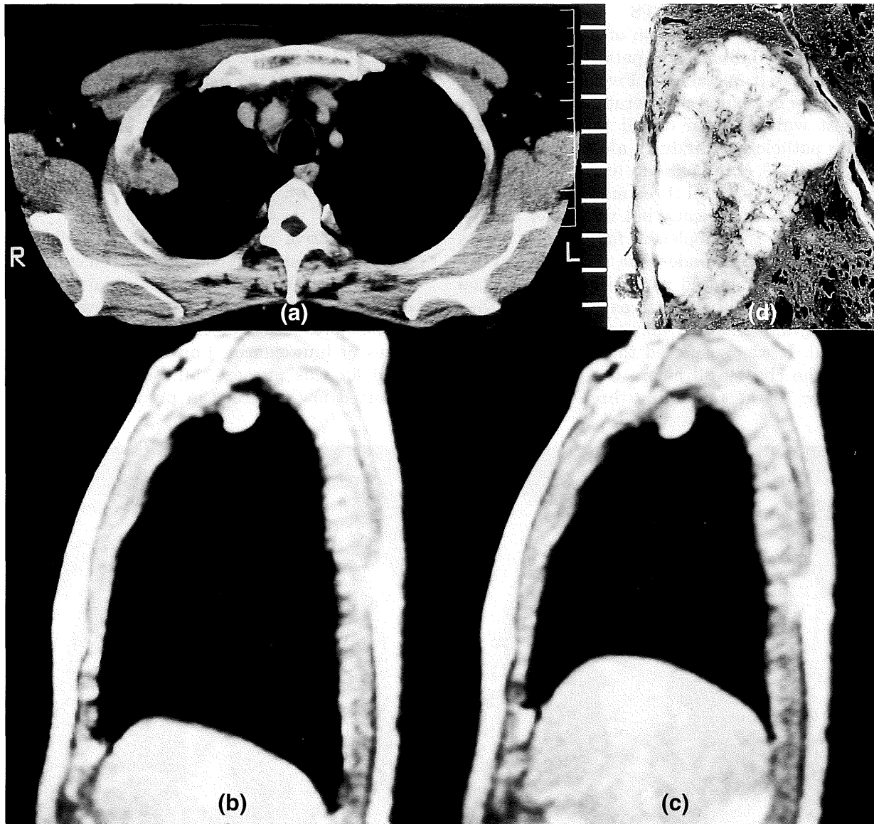
Fig. 2. Adenocarcinoma of left upper lobe in a 59-year-old man (case 10).

(a) There was a fatty plane between the tumor and the chest wall and it was evaluated as negative for chest wall invasion following CT. (b) Cine-MRI on deep inspiration. (c) Cine-MRI on deep expiration. They revealed no respiratory movement of the tumor. (d) Lobectomy specimen. Pathologically, adenocarcinoma extended to the parietal pleura.