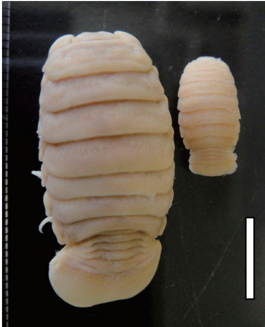
Fig. 1. Adult female (left) and male (right) specimens of Cymothoa pulchra Lanchester, 1902 (NSMT-Cr 22195) from the buccal cavity of Chilomycterus reticulatus (Linnaeus, 1758) caught in the western North Pacific Ocean off Nishidomari, Otsuki, Kochi, Japan. Dorsal view. Scale bar: 10 mm.

Williams et al. , 1996; Kuramochi et al. , 2003; Nagasawa & Doi, 2012), it is clear that C. pulchra occurs in coastal waters which are strongly influenced by the Kuroshio (Fig. 2). This distributional pattern of C. pulchra is affected by the geographical range of its tetraodontiform hosts, which are the above three species, the spot-fin porcupinefish Diodon hystrix Linnaeus, 1758 and the black-blotched porcupinefish D. liturosus Shaw, 1804 (Diodontidae) in Japanese waters. These five tetraodontiform fishes are subtropical and southern temperate species, and their distributions are restricted to warm waters. On the other hand, C. pulchra has not been reported from coastal waters of the ECS and the Sea of Japan (SJ) off Kyushu and Honshu islands, but since these waters are affected by the Tsushima Current, a branch of the Kuroshio (Fig. 2), and D. holacanthus migrates to the waters (Nishimura, 1960), this isopod may be discovered from the ECS and the SJ.