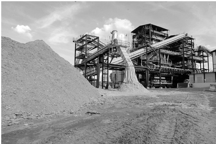
Figure 1. Bagasse stockpile and power generation facility in a sugar mill