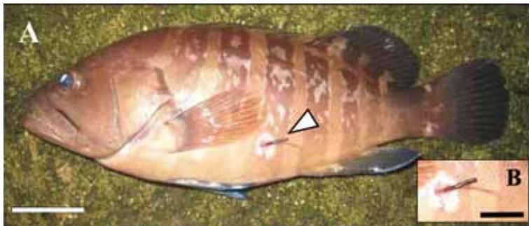
Fig. 2. Hyporthodus septemfasciatus (Thunberg) infected with an adult female of Lernaenicus ramosus Kirtisinghe, 1956. A, a fish harboring the parasite (arrowhead); B, a close-up view of the parasite at the attachment site. Scale bars: 50 mm for A, 20 mm for B.