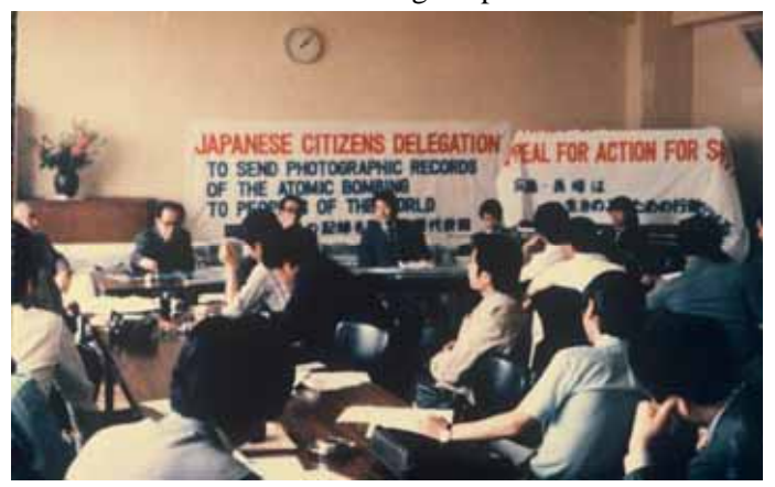
Fig.2 the Celebration of Establishing the group in Tokyo

There was also strong recommendation that young generation also had to attend the First U.N. Special Session on Disarmament. 30 persons formed "The delegation to present the record of A-bomb tragedy to the World" from May to June, 1978. Fig. 2 shows the ceremony celebrating the establishment of the group in Tokyo. I was one of the members of the group.