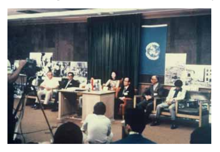
Fig.3 the Press Conference in U.N building

After arrival in New York, we participated in the next activity of Press conference. Fig.3 shows the press conference in the U.N building.