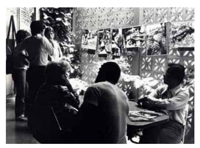
Fig.11 Visitors feeling about the photos

Our tour and photo exhibition had very important strategies. We were traveling with three cameramen who took the photographs. But misfortunately most of them died five or six years ago. We could hear their explanation with showing photos. For example, "Immediately after taking this photograph, houses begun to burn from left-hand side and I could not help other victims in agonized shrieking of the damned, either, but my tears covered the camera finder repeatedly losing sight in it". We could hear "Remember Pearl Harbor" when a photo exhibition is opened at the roadside. We said "we did not come to blame the United States. We came to warn to our future". Then, they understood about the significance of our mission. Now, the problem of a worldwide scale is called the warming phenomenon and food shortage. However, don't forget the miniaturization of nuclear weapons, the problem of nuclear proliferation, etc. The problem of nuclear weapons is always hanging around.