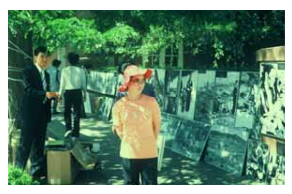
Fig 10 Photo Exhibition in front of Y.W.C.A. in Albuquerque

After leaving New York, we opened the photo exhibition in each place. The photo exhibition was opened at the roadside or under the eaves, without no reservation. They were held in New York, Washington, White Sands, and Los Angeles and Honolulu. Fig 10 is a photo exhibition in front of Y.W.C.A.in Albuquerque of New Mexico.