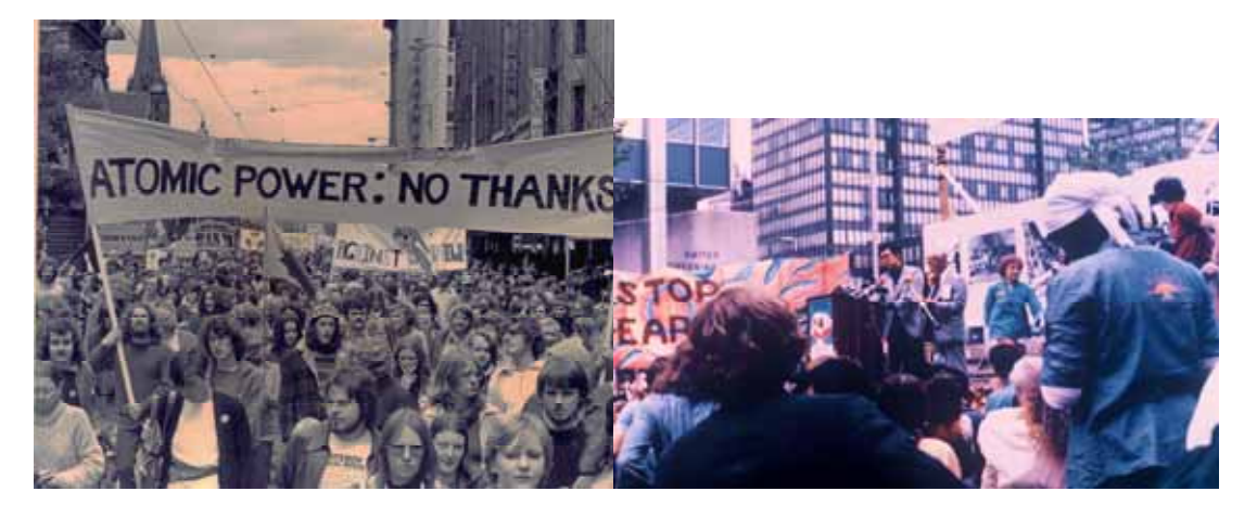
Fig. 6 the Rally for Survival

The newspaper reported that there had been no large-scale procession like that for a long time, after the Vietnam War ended. The A-bomb victims went up to the platform established in the Hammarshold plaza park which was the goal of a rally one after another, and they told experience of them to it, and it had many support from the audience. The folk singers and the actors also climbed the platform one after another, sang the song, a speech was made and the spot was filled with heat. Fig. 6 is the figure of the young men who were staging a rally. On the platform of the destination of a rally parade, a Japanese A-bomb victims' representative made a message (Fig. 7).