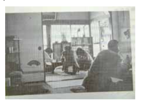
Fig.1 Investigation of the A-bomb victims (Hibakusha) in Miyagi Prefecture

There were 102 investigators (400 persons of a total). Not only the interview of A-bomb victims, but also hand drawn picture and the collection of signatures carried out simultaneously.