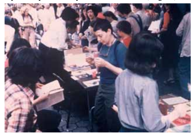
Fig.8 talking with the participants beside the rally

We always carried the photographs to show about the tragedy of Hiroshima and Nagasaki by A-bomb. We opened the corner which introduced a pamphlet. And we explained to the participants why we went there (Fig. 8).