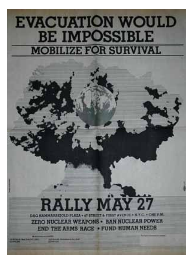
Fig.5 The Poster for the rally on "Mobilize for Survival"

On the other hand, near the Hammarshold plaza park, 15,000 people participated