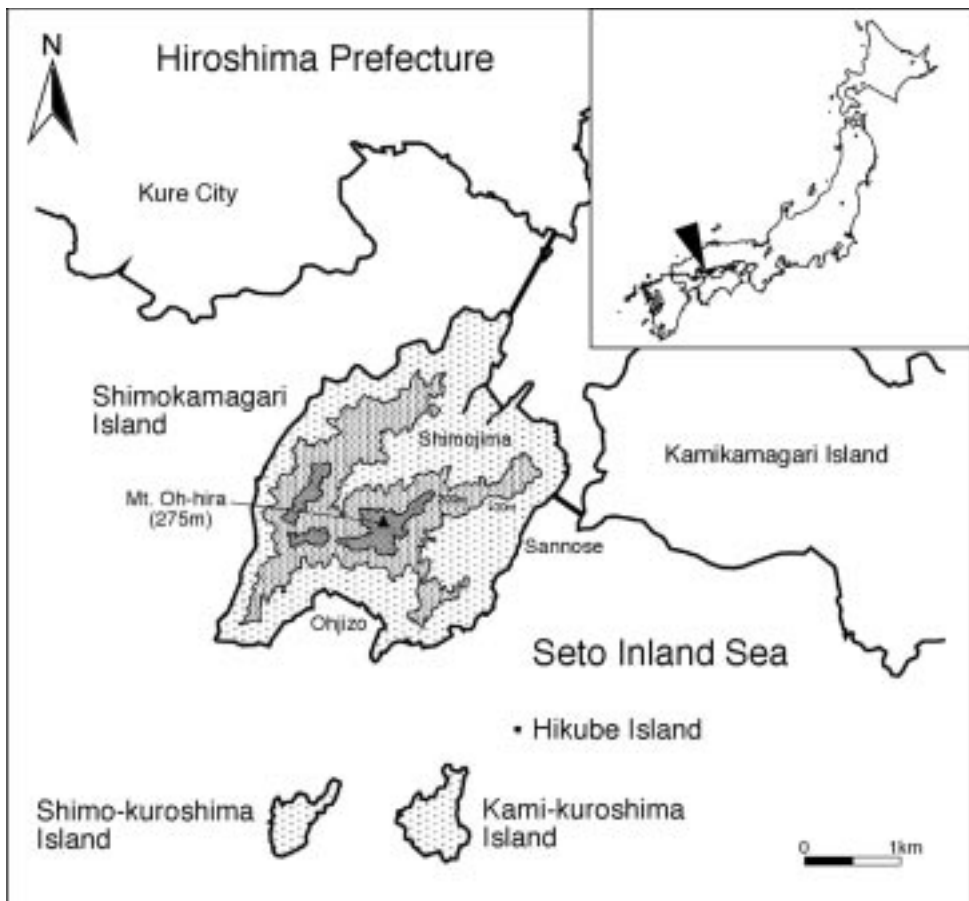
Fig. 1. Map showing the study area. The three altitudinal zones are (◻): <100m, (▨): 100-200m, and (■): >200m.

Shimokamagari Island was connected with Honshu by the Akinada Bridge in 2000, and the municipality was absorbed by Kure City in 2003.