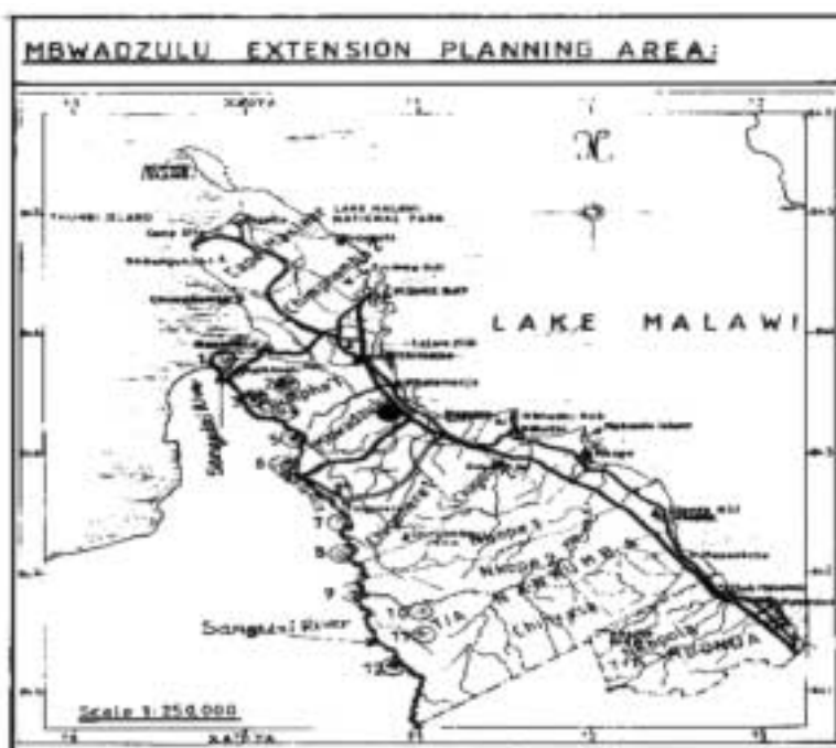
Figure 3: Map of Mbwadzulu EPA/Sangadzi Area

population of farm households were equally represented with those of high-density population of farm households thereby considering them as farmers unified by common factors of having small landholdings and farming within the same agro-ecological zone. Where the use of questionnaire was not feasible, data was collected through participatory rural appraisal (PRA) methods with groups of farmers. This paper also uses secondary sources of data in order to support the survey findings.