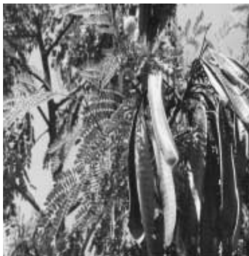
Figure 5: Leucaena tree grown in Sangadzi area

This study observed that leucaena is used as shade tree and source of firewood, mainly because farmers do not know its agronomic role. With proper guidance, resource poor farmers can put such useful unutilised local resources to productive use in order to improve soil fertility and raise food security for their households. Thus, farmers must be assisted to maximise the use of the low cost beneficial traditional practices.