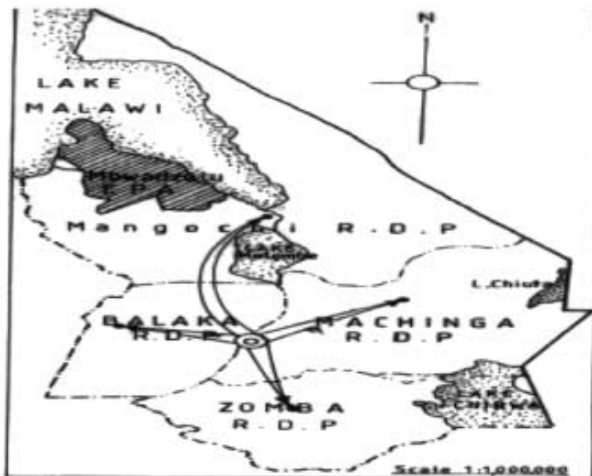
Figure 2: Map of Machinga ADD showing location of Mbwadzulu EPA*