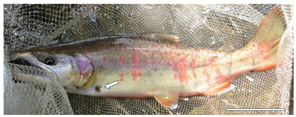
Fig. 1. Anadromous adult male of Oncorhynchus masou ishikawae (327 mm SL) infected with an adult female of Argulus coregoni (arrow, 13.0 mm long) on the body surface near the gill operculum. The fish was collected in the Usa River, a tributary of the Nishiki River, Yamaguchi Prefecture, on 3 October 2014. Scale bar: 75 mm.