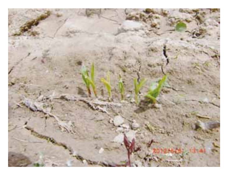
Figure 2. View of the damaged maize crop land afterward heavy rain and mudflow in spring, BVG

In study area, HHs experience substantial differences in precipitation both within the year and between years. So, low or high levels of precipitation pattern have led to a diverse range of coping strategies. Heavy rains at planting time resulted in higher soil moisture conditions and longer than normal snow cover in higher elevations which delayed farm operations by 2-3 weeks (FAO/WFP, 2010). Severe frost and sometimes snow affected crops in single cropping pattern of the study area between April and May. This also leads crop losses with yield reduction (Zhumanova, 2011). Rapidly sharp increase in temperature in May and June, after heavy rain, hail and flood, caused unfavorable condition for seedlings; soil surface become hard and seedlings cannot grow up (Figure 2). Thereafter, farmers have to reseed crops.