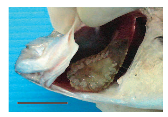
Fig. 1. Adult female of Norileca indica infecting the left branchial cavity of Selar crumenophthalmus from Pattani Bay, southern Thailand. Scale bar: 20 mm.

ined for parasites. Isopods were removed from fishes and fixed in 70% ethanol. Voucher specimens are deposited in the crustacean (Cr) collection at the National Museum of Science and Technology, Tokyo (NSMT-Cr 20854). The English and scientific names of fishes follow Froese & Pauly (2009).